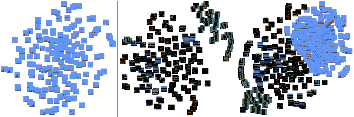
Fig. 4. From left to right, t-SNE visualizations for training segments using VAEs trained on only Super Mario Bros. , only Kid Icarus , and both.

GDCML tools. Future work could also look into using other visualization techniques such as UMAP [111] which has been shown to exhibit certain benefits over t-SNE [112].