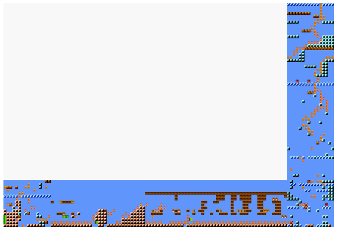
Fig. 1. Example level that blends Super Mario Bros. and Kid Icarus .